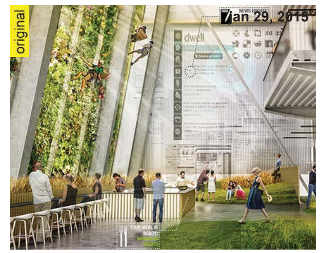
organic grid+ wins workplace of the future 2.0 design competition

inside a chapel 50 kilometers west of são paulo's bustling center, a set of wooden chairs subtly reference »