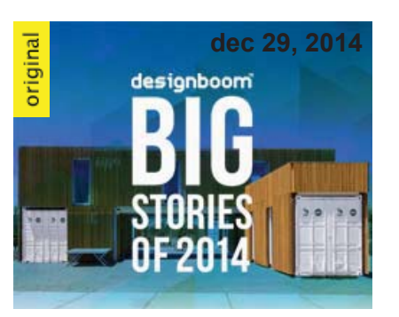
TOP 10 shipping container structures of 2014