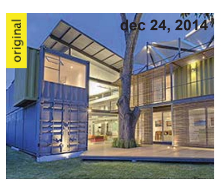
maria josé trejos fills containers of casa incubo with »