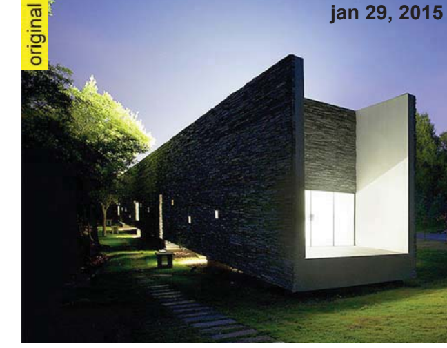
david adjaye adds light box villa to sifang art museum site in china