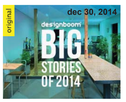
TOP 10 restaurant and retail interiors of 2014