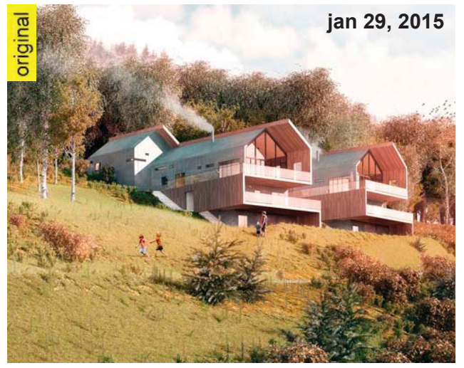
wrap house concept by ctrl+n maximizes natural light and scenic views