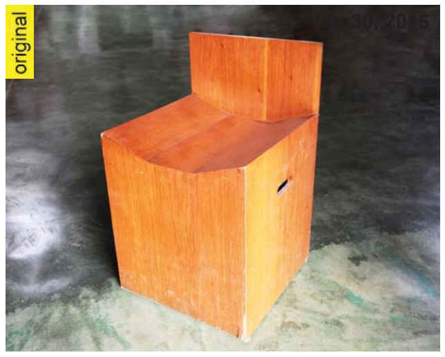
lina bo bardi's wooden chairs inside her são paulo chapel